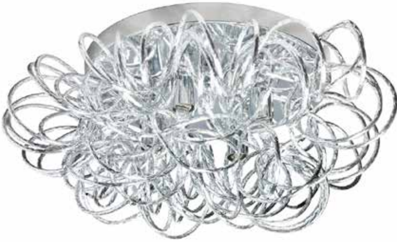
4 Light Tubular Flush Mount Fixture, Polished Chrome Finish